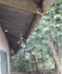
Calaitan Km 8 & km 14 Church : almost 50% of these properties is buried due to landslide. Complete rehabilitation needed.