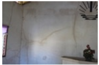
San Juan Church: Complete Repair needed