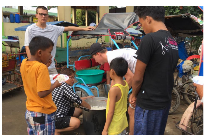
Providing meals at City West Evacuation Center