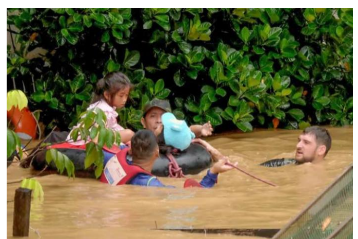
Search and Rescue Operation

As an immediate response to the tragedy, the Philippine Island Kids Int'l. Founation, Inc. (PIKIFI) took part in the search and rescue operations in Cagayan de Oro City. Between December 22-27, PIKIFI also distributed a total of 6,200 meals to survivors who are temporary sheltered in the four evacuation centers City West Elementary School, City Central Elementary School, Makanhan Senior High-School, and Pilgrims Christian College.