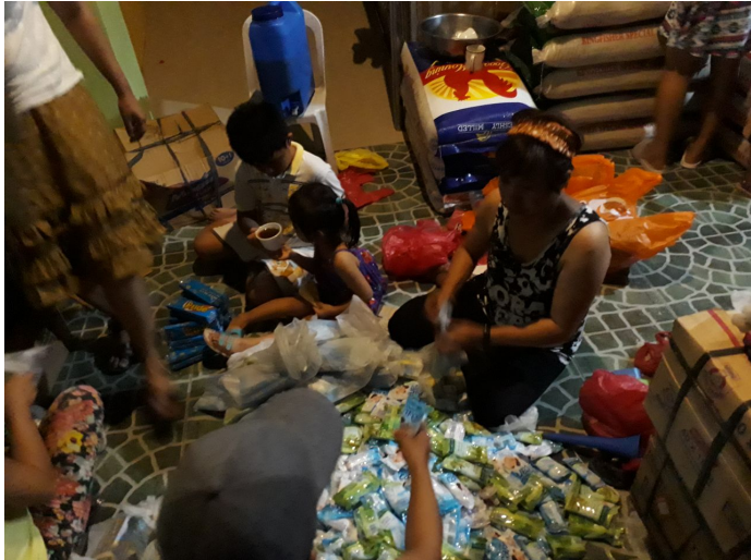
Repacking Relief Goods at PIKIFI-Learning Center